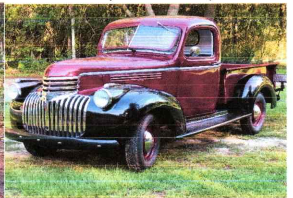
Chevrolet & American Trucks

All Vintage & Classic owners are welcome to register & exhibit